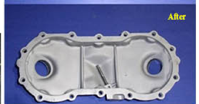
Oil Pan Cover